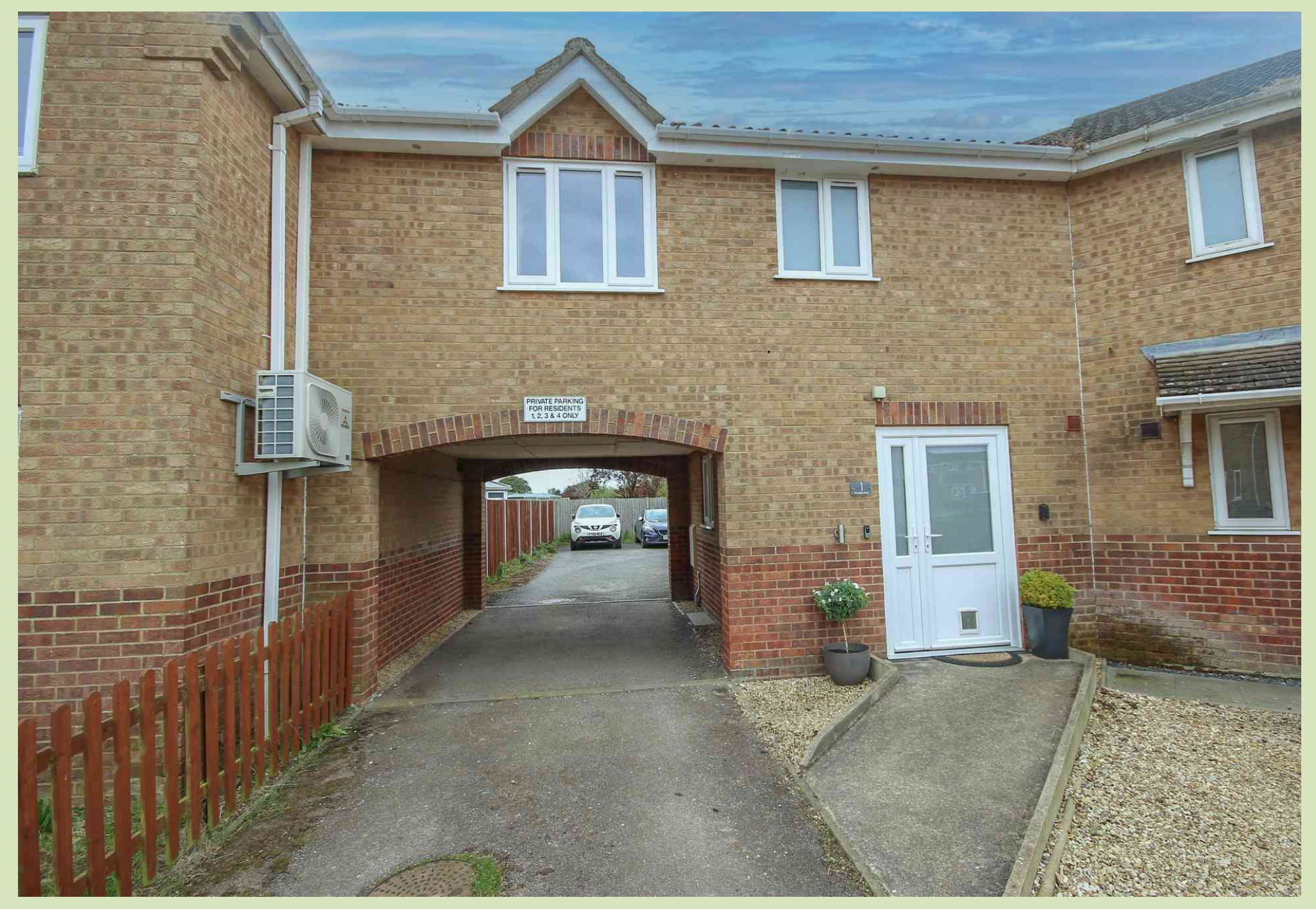
1 Punsfer Way, Tilney St Lawrence Guide Price £149,950