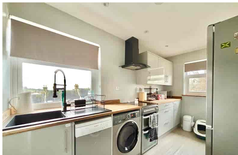
FLAT 653 sq.ft. (60.7 sq.m.) approx.