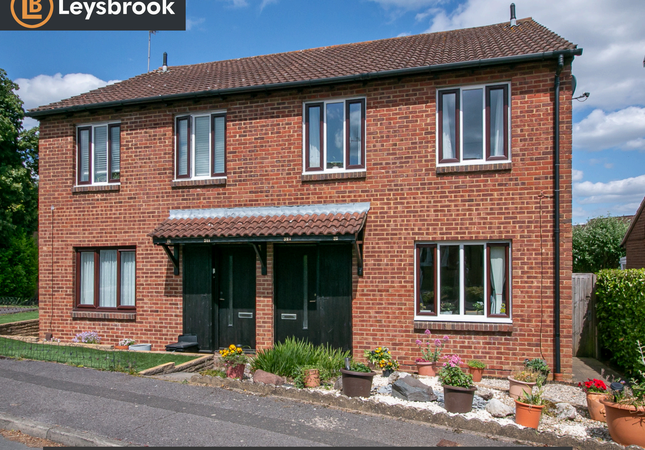
Beverley Gardens, St Albans Guide Price of £260,000