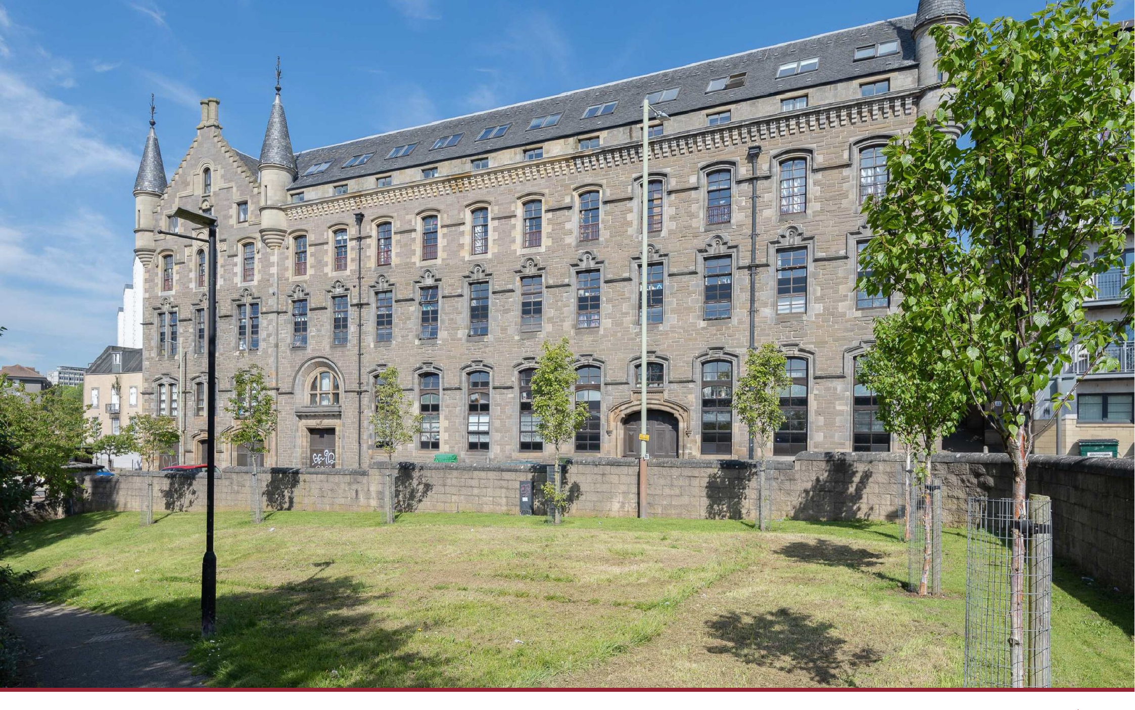
19 Bonnethill Place | Dundee | DD1 2AD