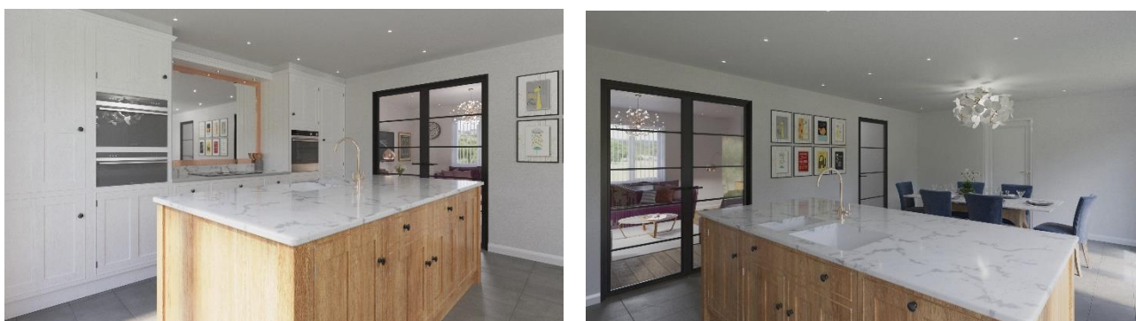
EXAMPLE DINING KITCHEN PHOTOGRAPHS

UTILITY ROOM (9'7 x 6'4) To be finished in the same Thwaites Holme kitchen. Plumbing for washing machine, sink unit and doors to rear garden, cloakroom, garage and boiler cupboard.