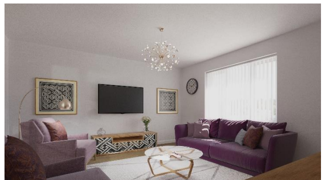
EXAMPLE LOUNGE IMAGES

DINING KITCHEN (22'8 x 14'5) Two sets of bi-folding doors leading out to the rear patio. Purchasers have a choice of Thwaites Holme kitchen with plenty space for a kitchen island. Door to separate utility room.