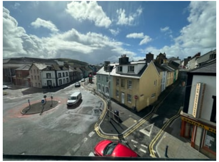
Front Bedroom 4