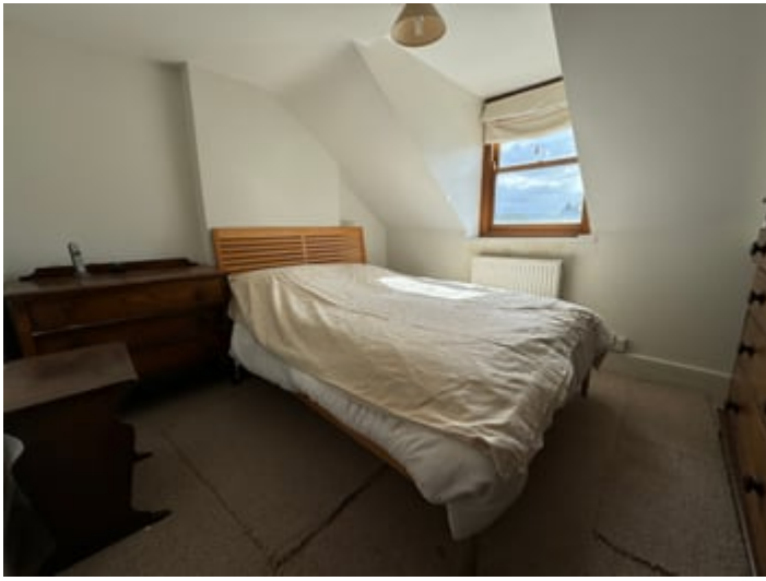
Front Bedroom 3

14' 6" x 10' 3" (4.42m x 3.12m) double bedroom, dual aspect windows to adjoining streets, multiple sockets, radiator.