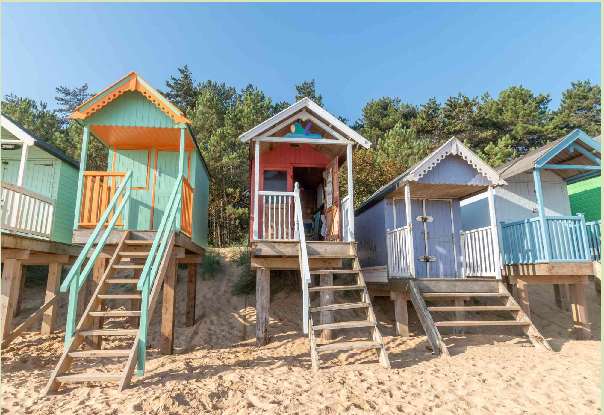
Flounder, Wells-next-the-Sea Guide Price £85,000