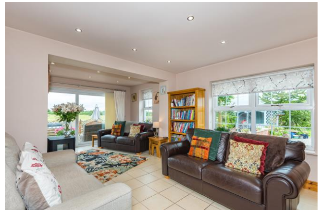
SUN ROOM/DINING AREA