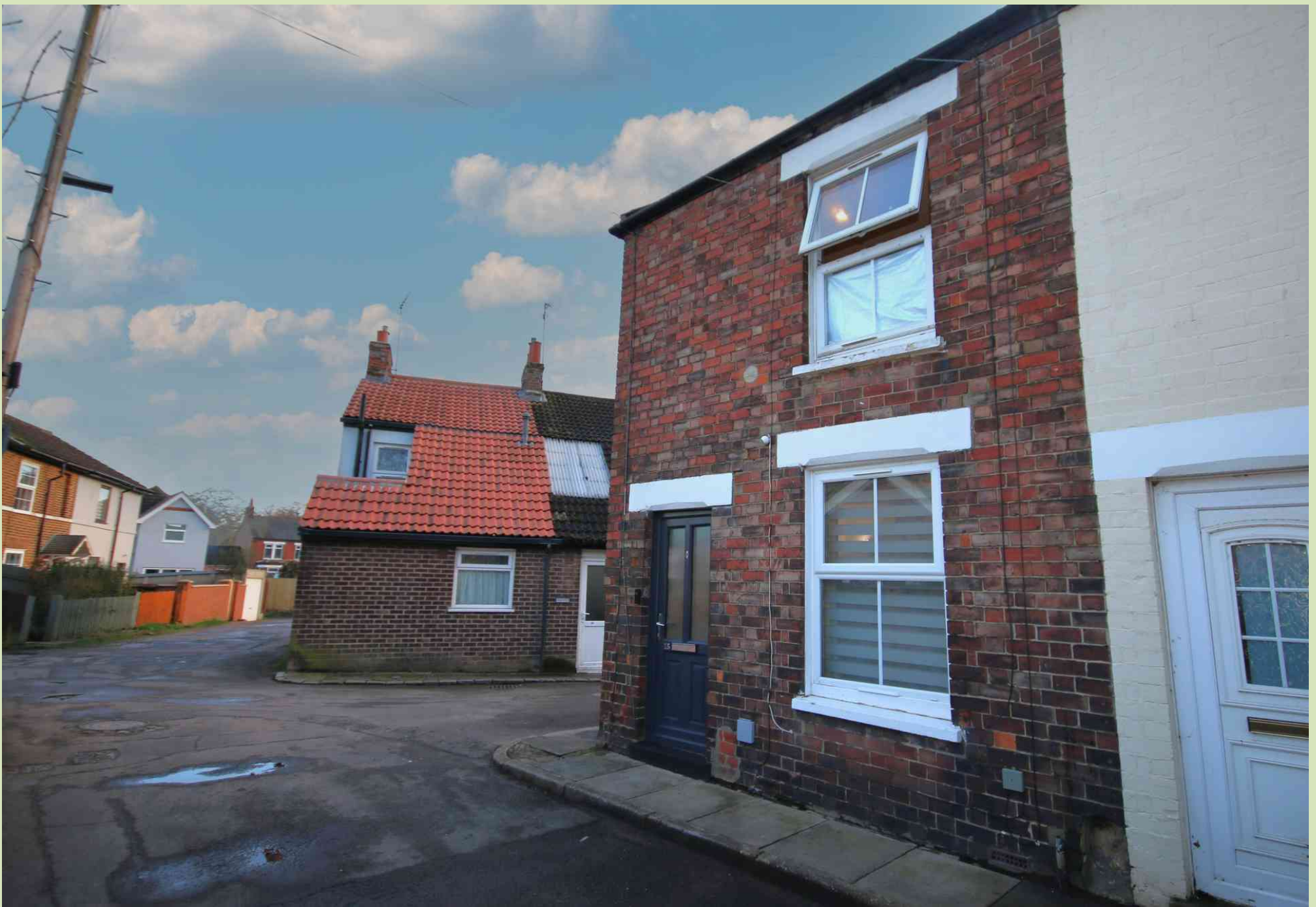
15 Thomas Street , King's Lynn Guide Price £119,950