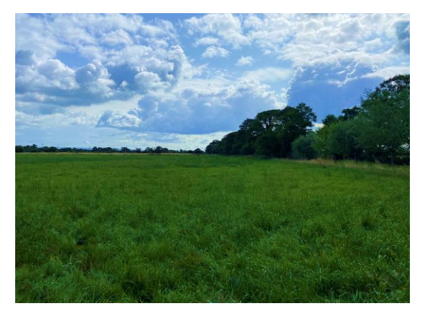
Auction Guide Price: £45,000 to £55,000*

Wednesday 20<sup>th</sup> September 2023, 12 midday The Theatre, The Royal Bath and West Showground, Shepton Mallet, BA4 6QN Bid remotely via Livestream, in person or by proxy.