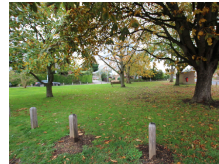
36 The Leys, Langford, Biggleswade, Bedfordshire, SG18 9RS