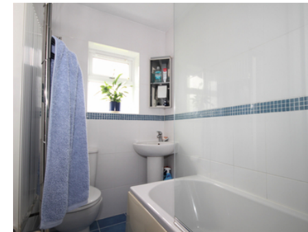
83 High Avenue, Letchworth Garden City, Hertfordshire, SG6 3QW