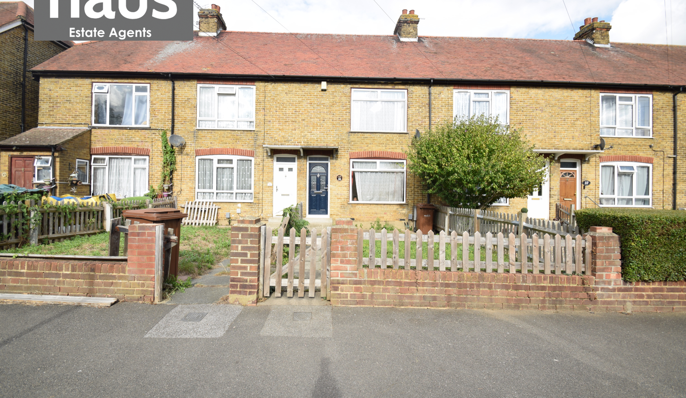
Three Bedroom Terraced House Brown Street, Gillingham, Kent, ME8 7JN