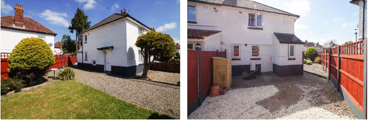
FRONT, SIDE AND REAR GARDENS

OUTSIDE The property sits on a generous corner plot with gated driveway to the front with lawned area, floral borders and wrap around hedges. Side shillied garden and low maintenance fence enclosed rear garden mainly laid to shillies with external water tap.