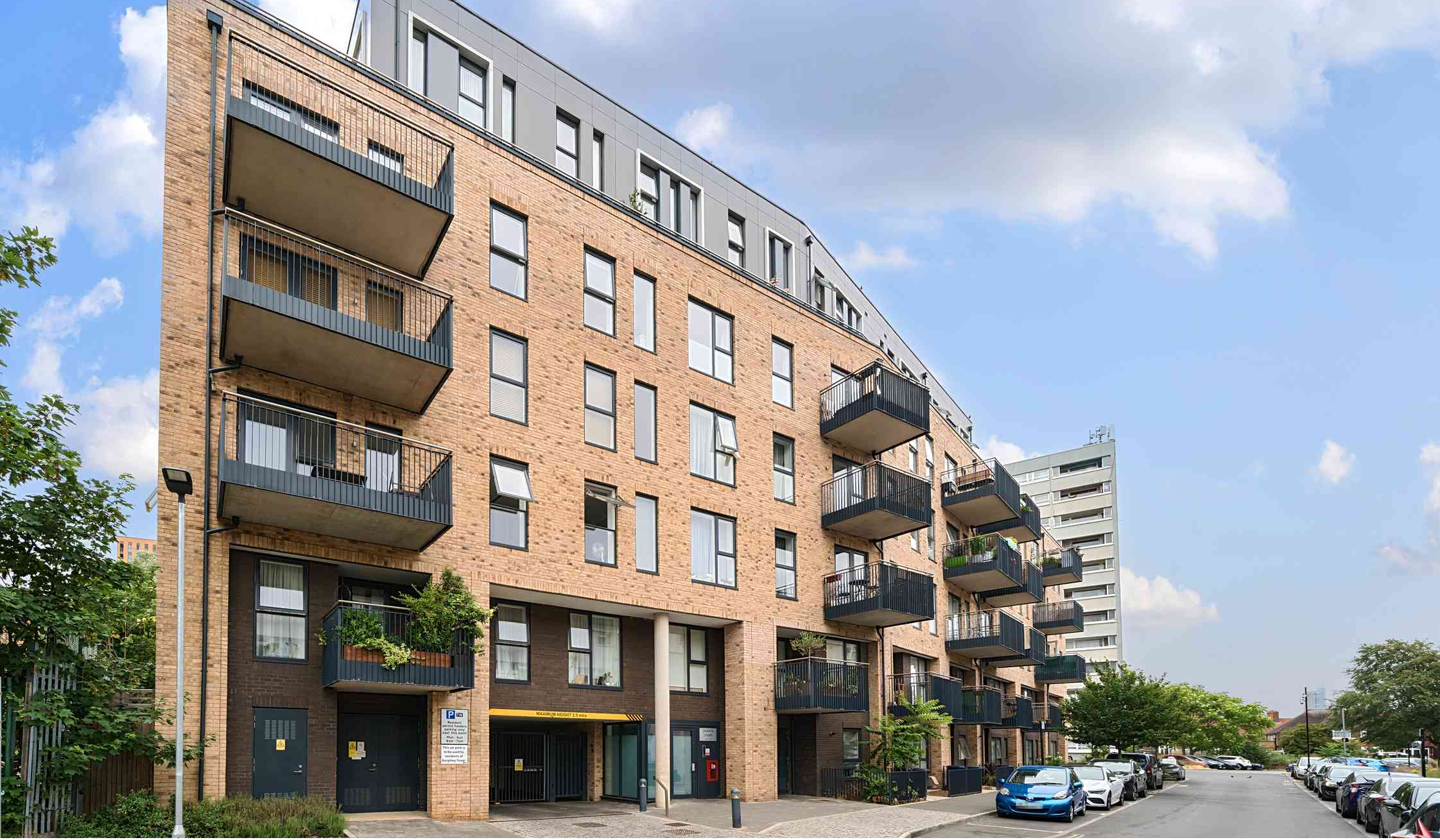
Trinity Way, London, W3 7FU