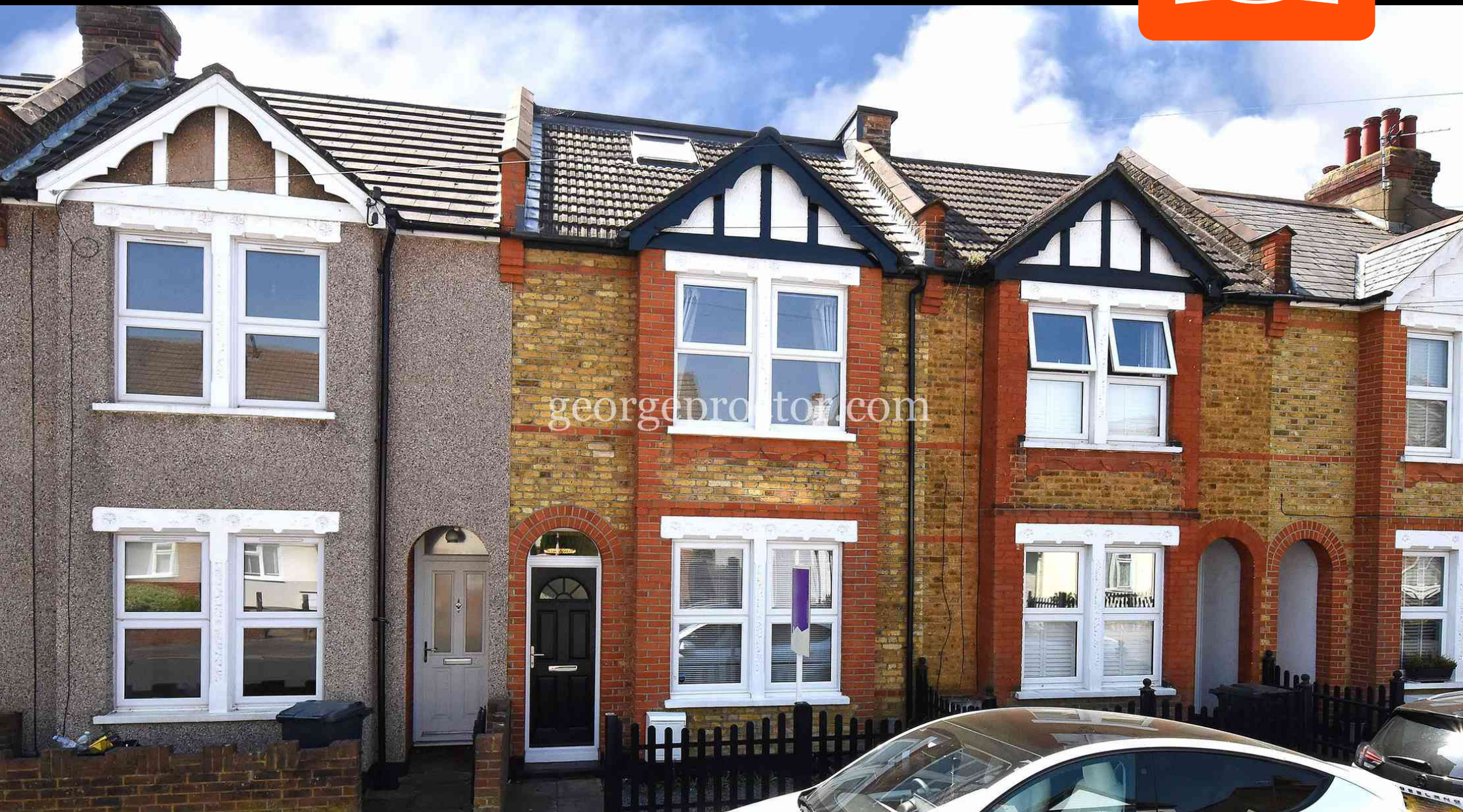
Herbert Road, Bromley, Kent. BR2 9SH