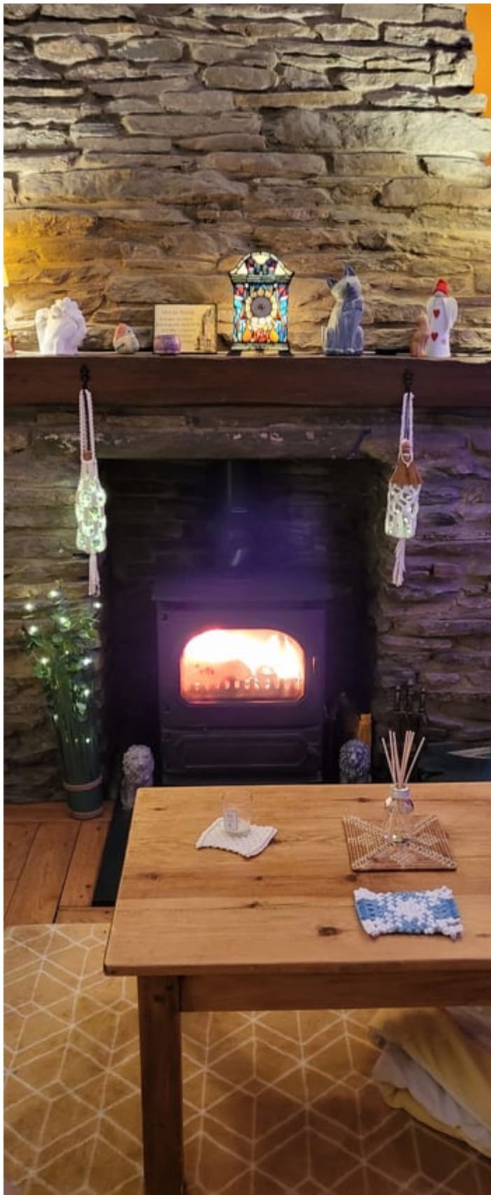
LIVING ROOM (SECOND ANGLE)