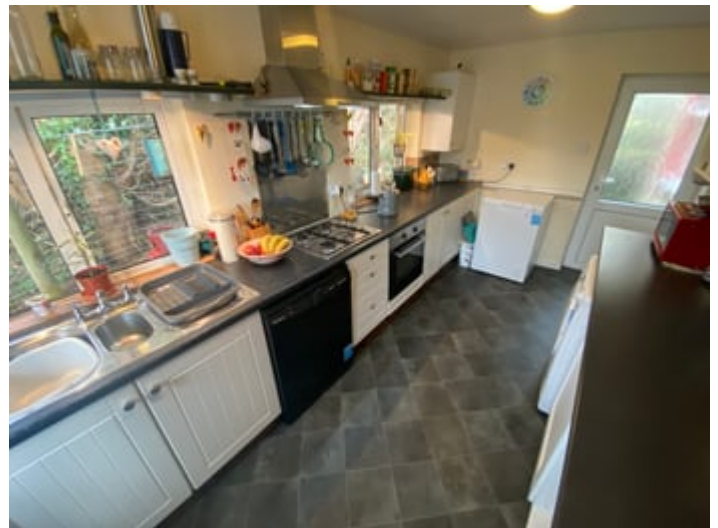
KITCHEN (SECOND ANGLE)

15' 7" x 7' 8" (4.75m x 2.34m). A modern cottage style fitted kitchen with wall and floor units with work surfaces over, fitted electric oven with 4 ring gas hob with extractor hood over, 1 1/2 sink and drainer unit with mixer tap, plumbing and space for automatic washing machine and dishwasher, half glazed rear entrance door to garden yard area with steps leading to the garden, fitted blinds.