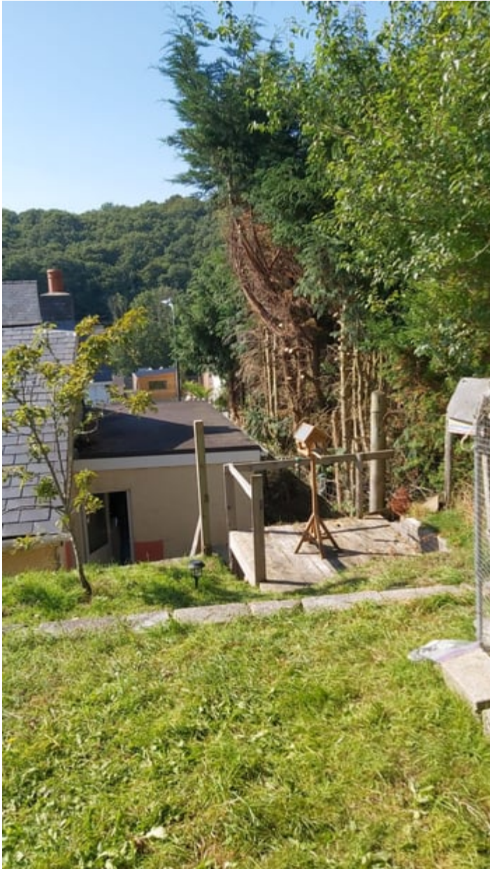
GARDEN (THIRD IMAGE)