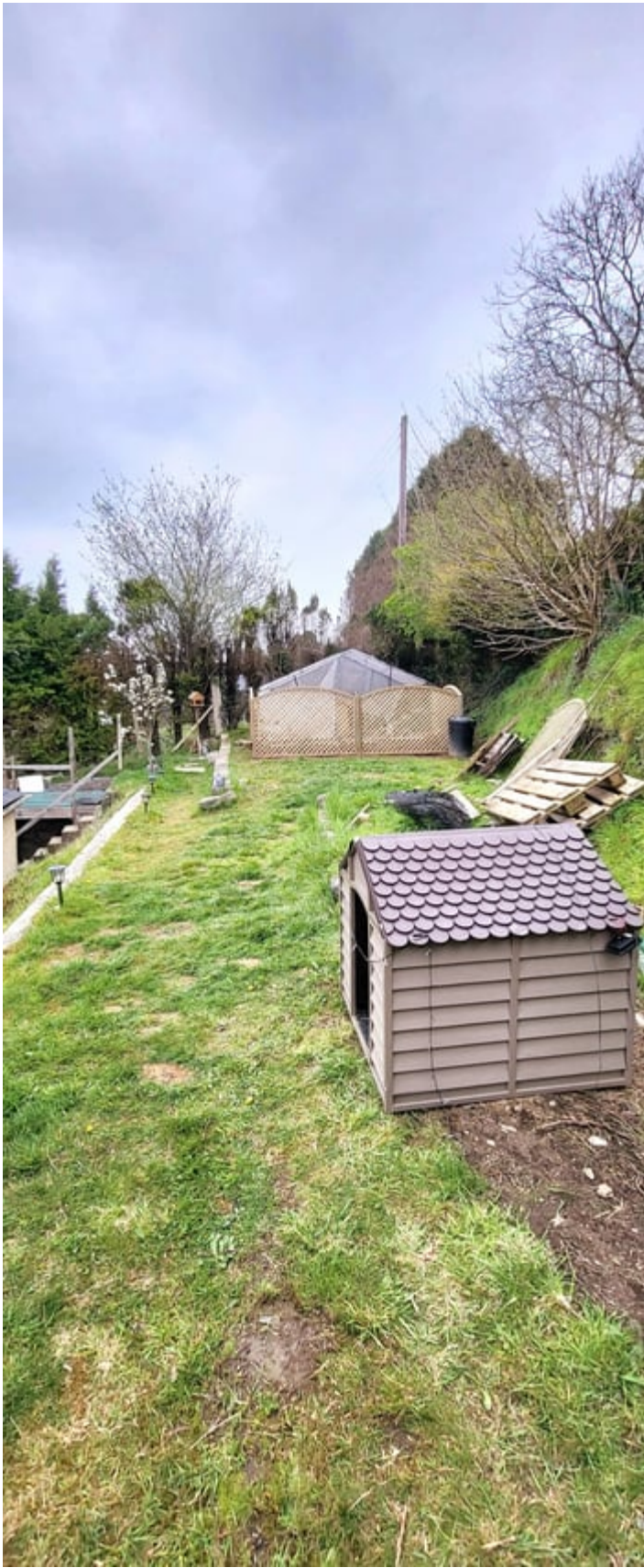
GARDEN (SECOND IMAGE)