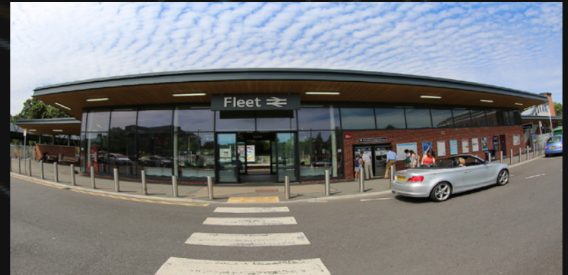
Fleet Mainline Railway Station