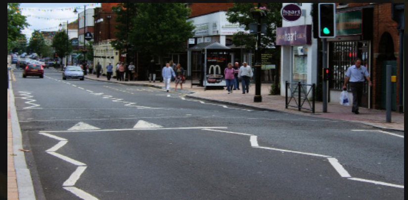
Fleet High Street