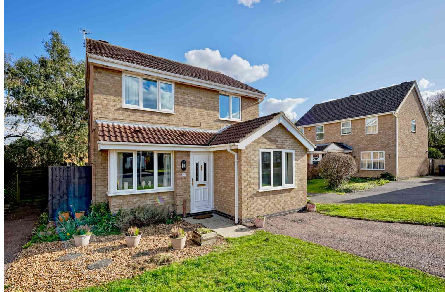
Ennerdale Close, Stukeley Meadows PE29 6UU