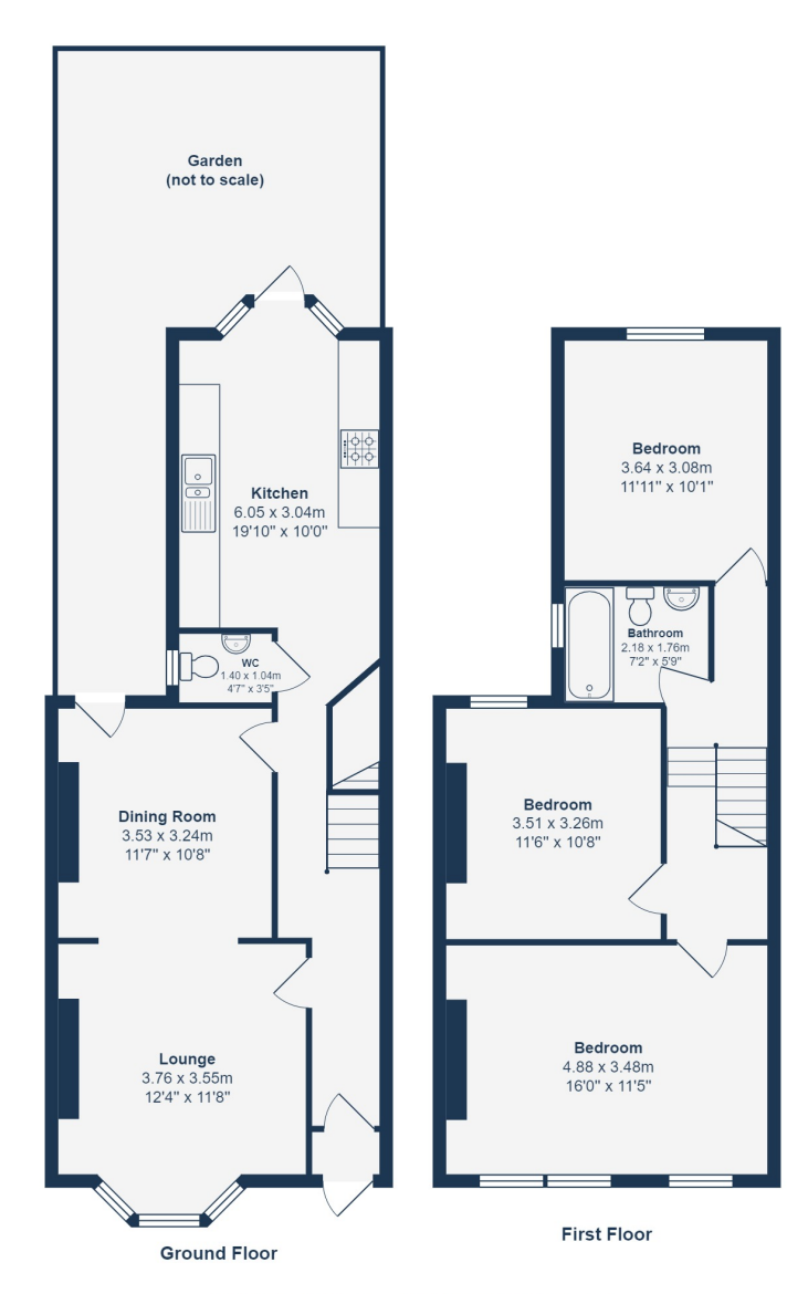
Total Area: 105.1 m<sup>2</sup> ... 1131 ft<sup>2</sup> (excluding garden)

Call 020 8690 3656 or email us at catford@stanfordestates.london to arrange a viewing or request further information