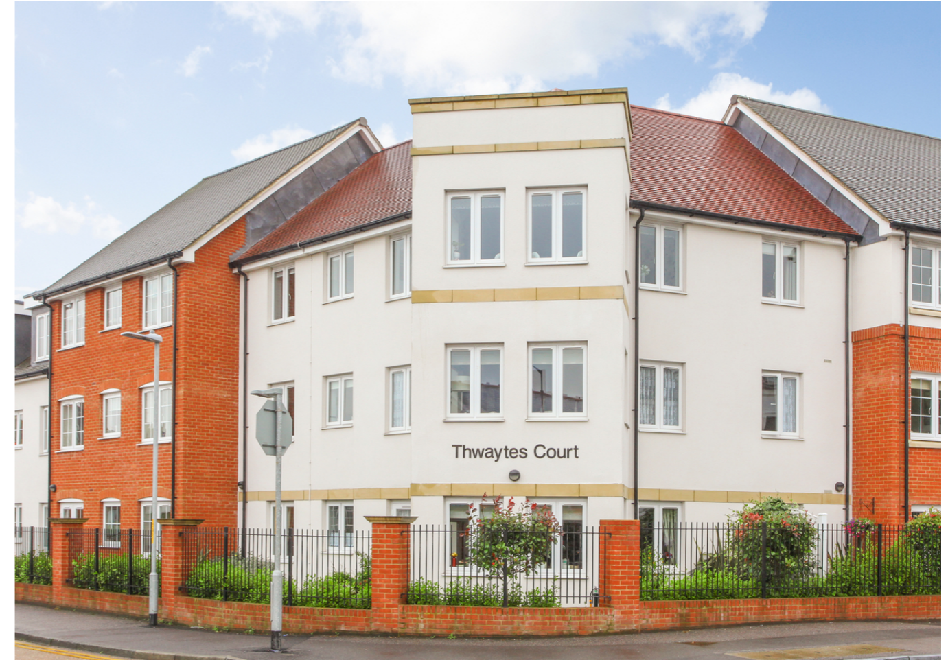
48 Thwaytes Court, Minster Drive, Heme Bay, Kent, CT6 8BF