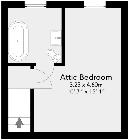
2nd Floor Area 18.5 sqm 199 sqft

A delightful 3 bedroom cottage situated in the center of this attractive Somerset village, teeming with character and period features throughout.