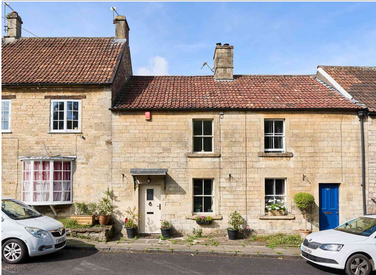
48 High Street, Hinton Charterhouse