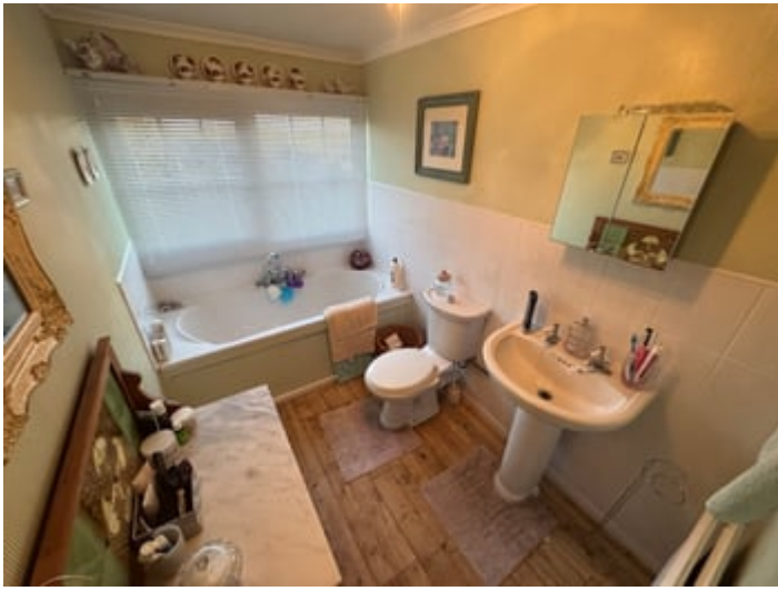
12' 3" x 5' 5" (3.73m x 1.65m) Panel bath, single wash hand basin, WC, radiator, window to front, wood effect vinyl flooring.