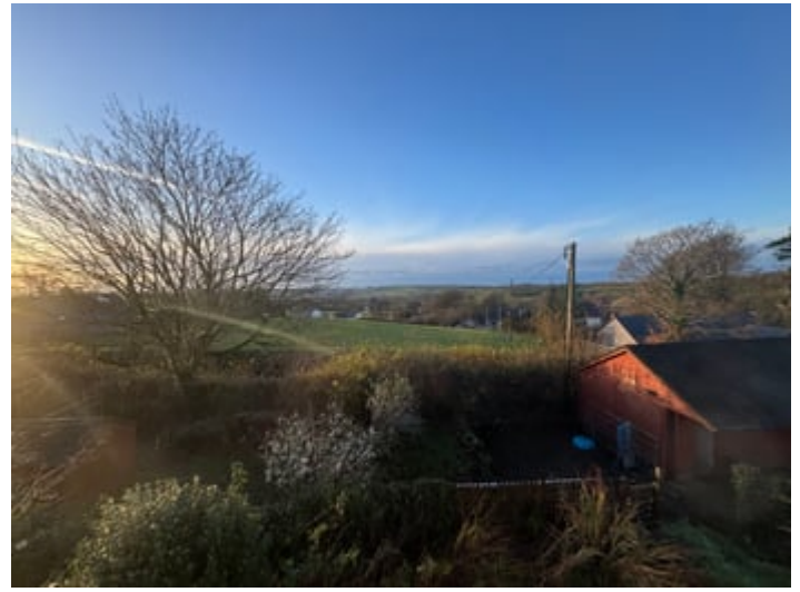
9' 1" x 12' 1" (2.77m x 3.68m) double bedroom, window to side with countryside views towards Cardigan Bay coastline, fitted wardrobes, multiple sockets, radiator.