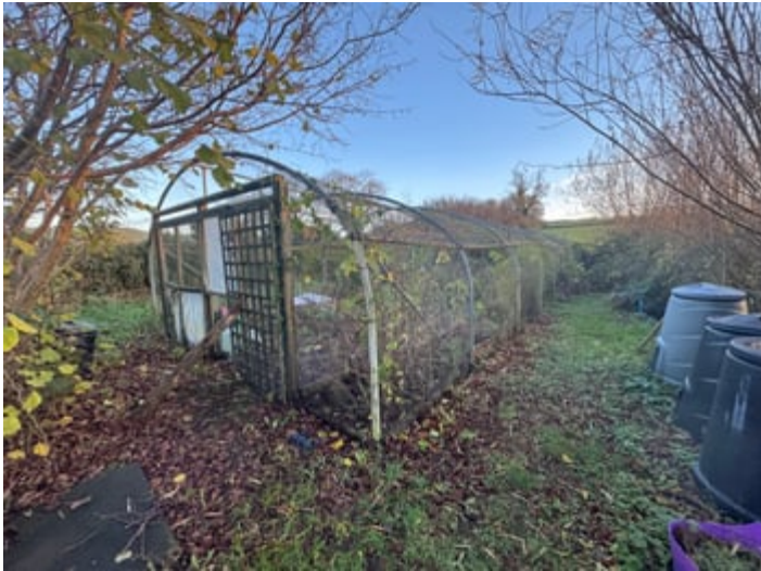
50' 0" x 20' 0" (15.24m x 6.10m) of aluminium frame construction.