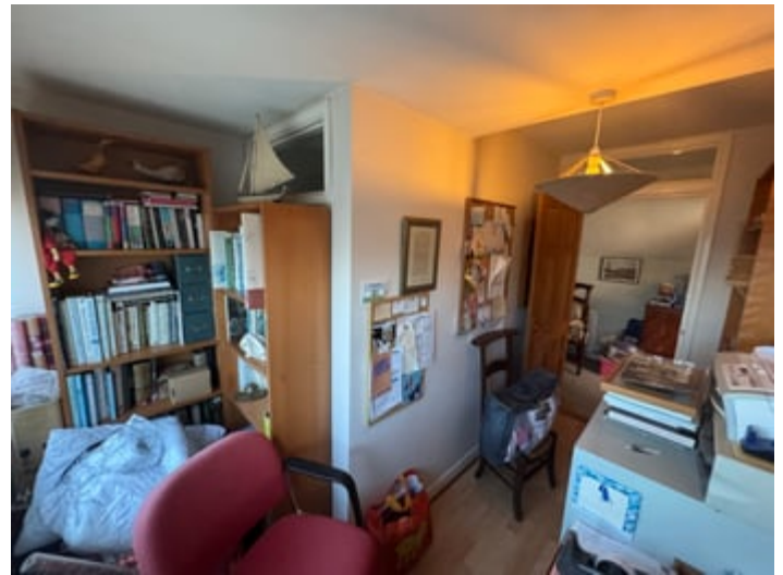
11' 1" x 7' 2" (3.38m x 2.18m) single bedroom currently used as a study, window to front, laminate flooring, multiple sockets, radiator.