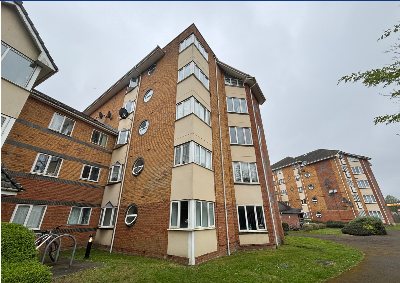
Oxford Road, Reading, Berkshire. RG30.