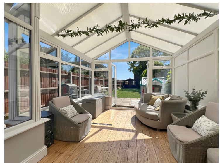
18' 8" x 13' 5" (5.69m x 4.09m)