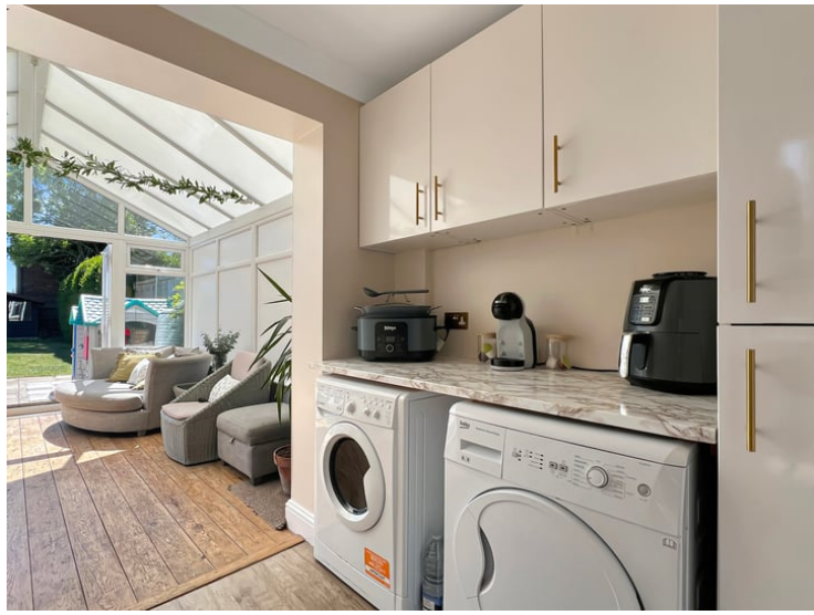
7' 2" x 5' 7" (2.18m x 1.70m)