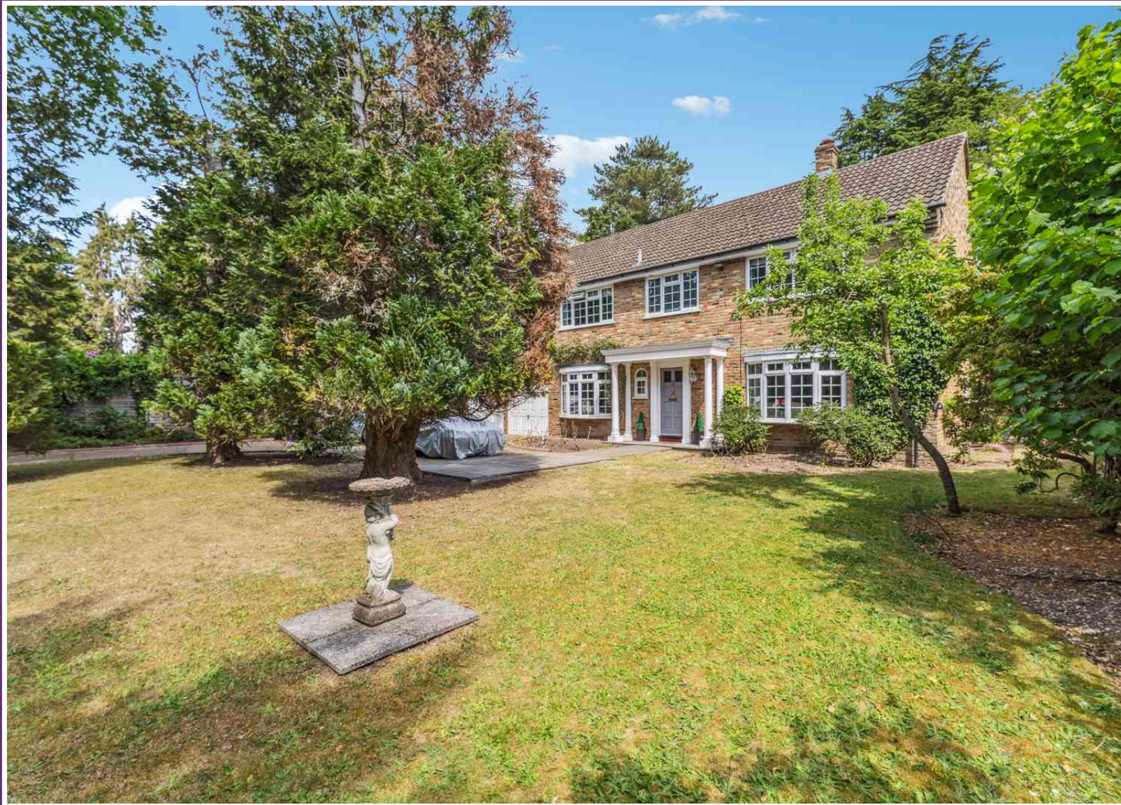
The Lodge, Parsonage Lane, Farnham Common, Buckinghamshire. SL2 3PA.

HILTON KING & LOCKE SPECIALISTS IN PROPERTY