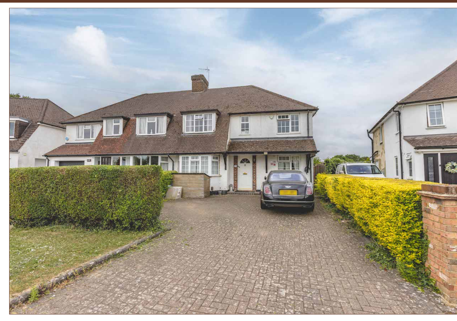
Oakwood Estates are proud to present this extended five-bedroom semi-detached family home, located on a highly soughtafter residential road and offered to the market in excellent condition.

Set on a generous plot, this deceptively spacious property provides flexible and versatile living accommodation, ideal for growing families.