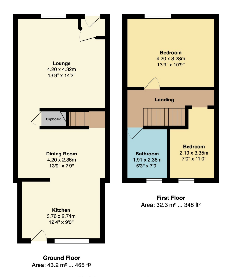
Total Area: 75.6 m<sup>2</sup> ... 814 ft<sup>2</sup>