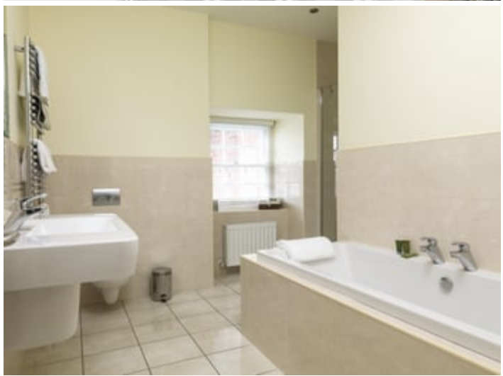
En-suite Bedroom with bathroom