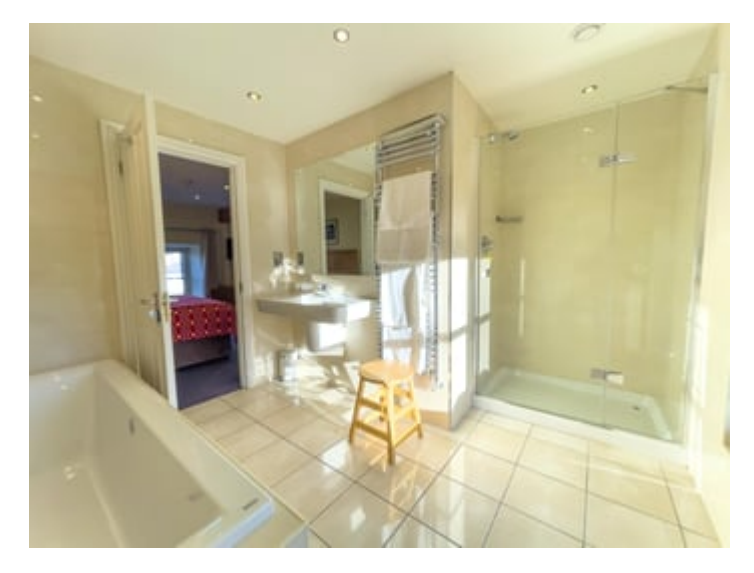
En-suite Bedroom with bathroom