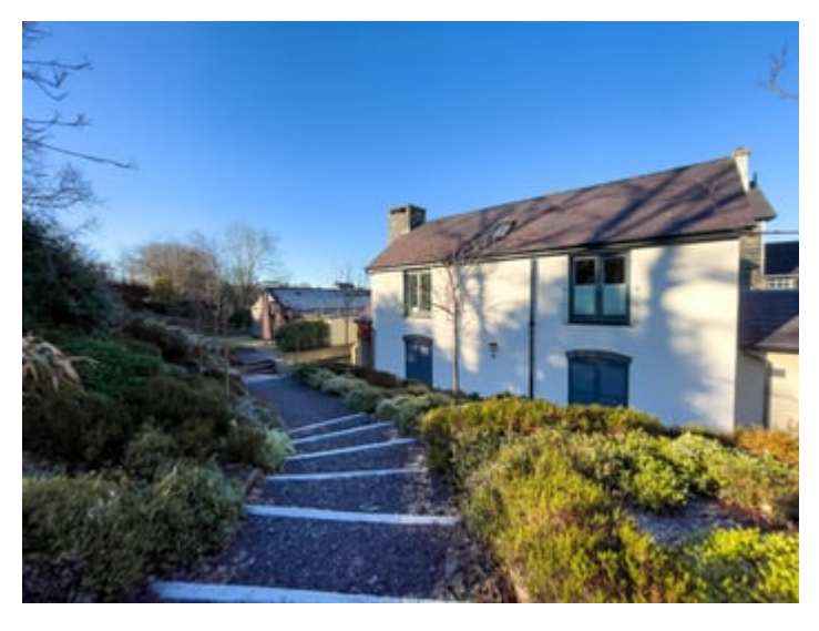
Beer Garden and Patio