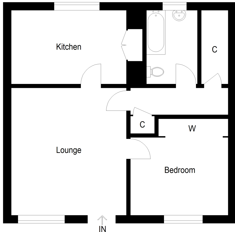
Illustration For Identification Purposes Only. Not To Scale (ID1226852 / Ref:91062)