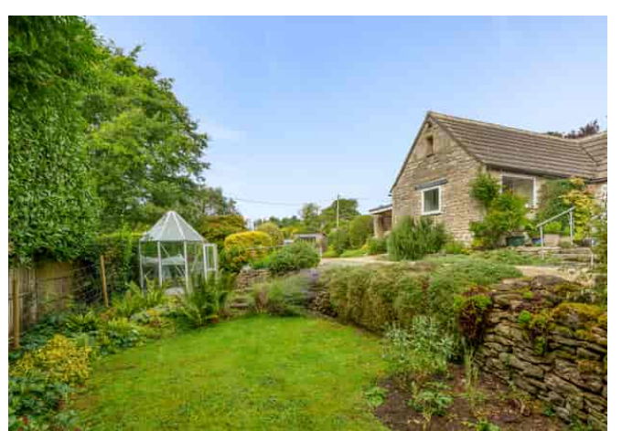
The Coach House, Smythe Meadow Skaiteshill, Brownshill, GL6 8SH

Chain free - A three bedroom detached Grade II listed coach house conversion in need of some updating located in Skaiteshill with large reception rooms, parking and character features throughout.