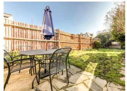
Burlington Road, Thornton Heath, Surrey, CR7