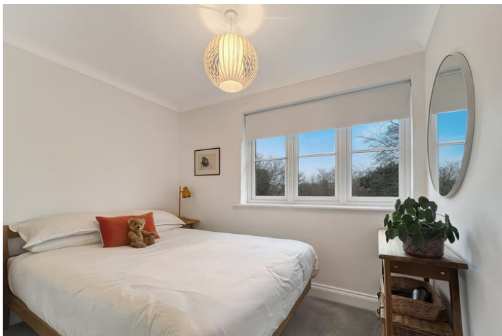
3.05m x 3.02m (10' 0" x 9' 11")