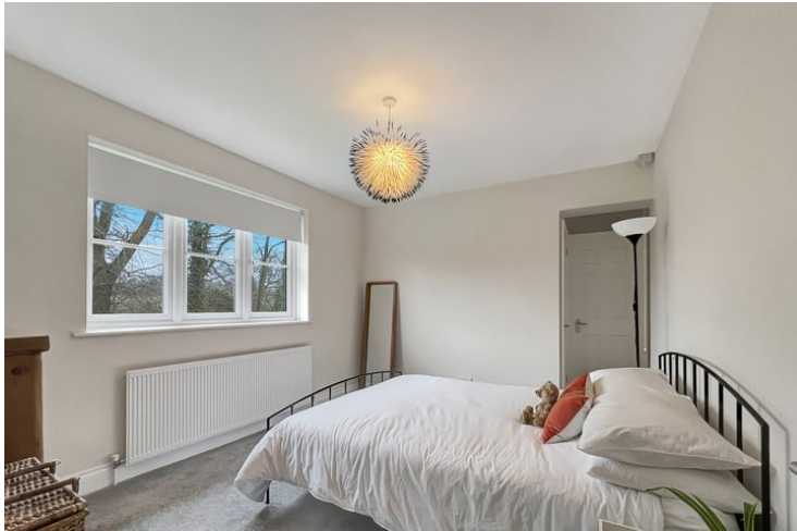
3.66m x 3.05m (12' 0" x 10' 0")