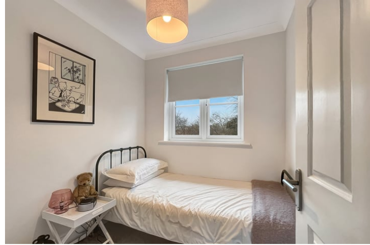
2.36m x 2.06m (7' 9" x 6' 9")