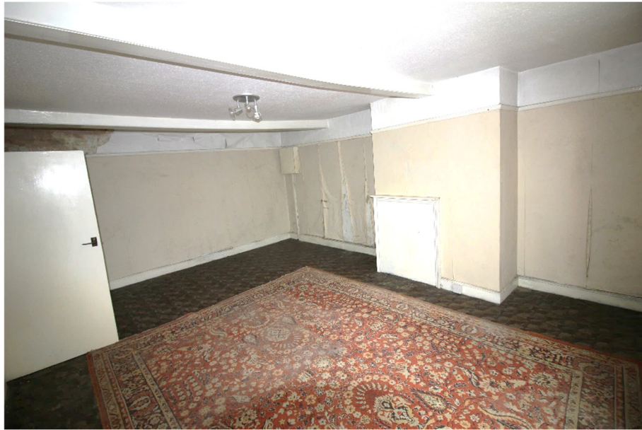
Front Bedroom 1