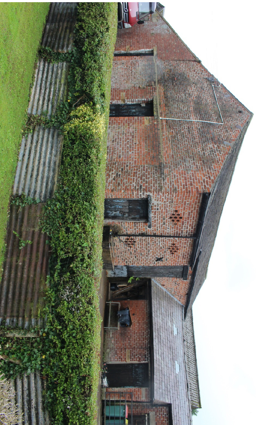
Farmhouse and Barn Entrance