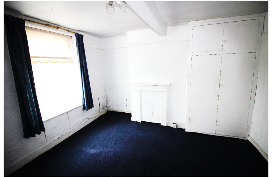
Front Bedroom 2