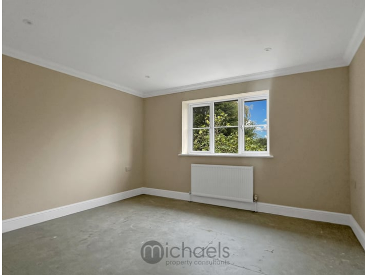
18' 0" x 12' 9" (5.49m x 3.89m) UPVC window to front.