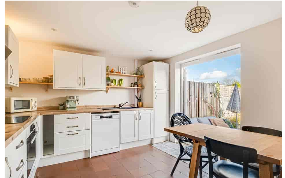
Garners Way, Harpole, Northampton NN7 4DN Offers Over £300,000 - Freehold