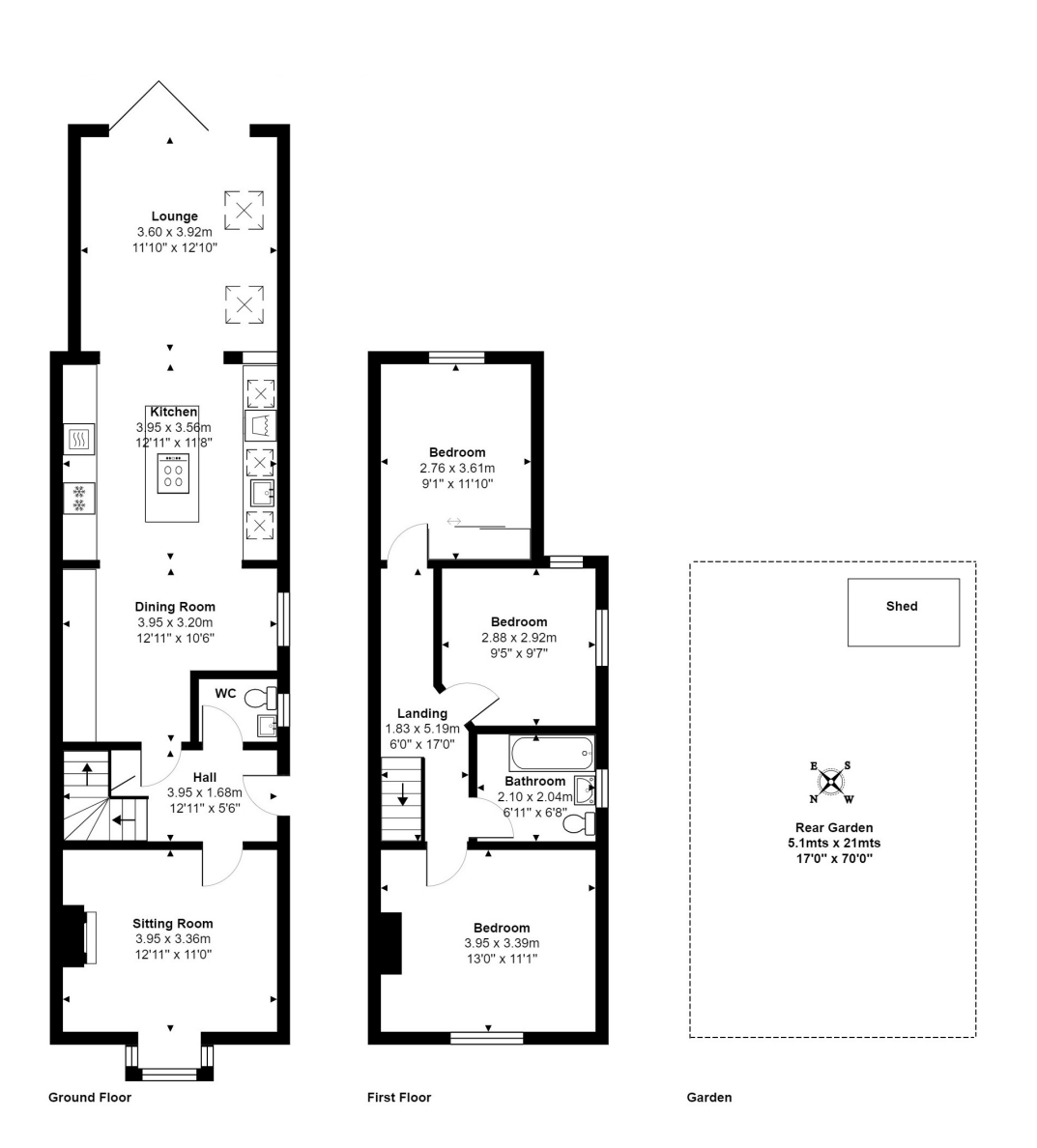
Total Area: 108.8 m^2 \ldots 1171 ft^2 All measurements are approximate and for display purposes only.

127a, High Street, Staines-upon-Thames, TW18 4PD 01784 451458 staines@gregory-brown.co.uk