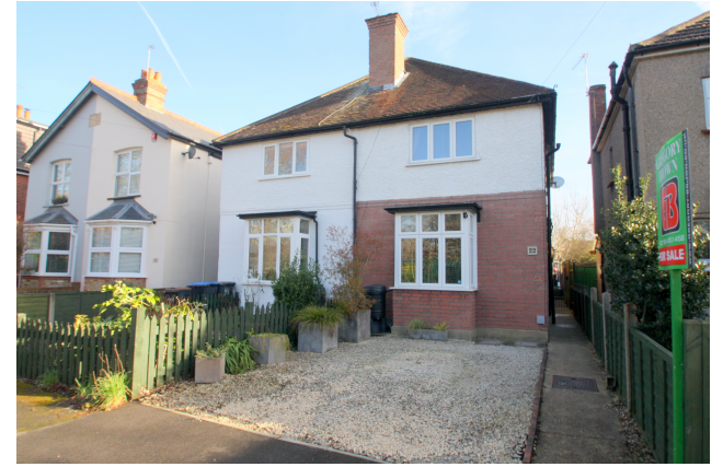
Mainly laid to gravel with pathway to front door.