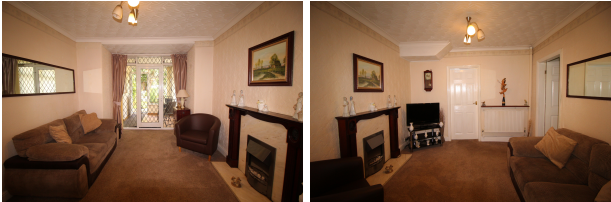
3.03m x 4.08m (9' 11" x 13' 5") Electric fire with surround, radiator