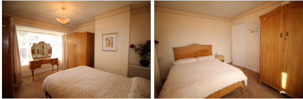
3.80m x 3.11m (12' 6" x 10' 2") Positioned at the front of the property with double glazed bay window.