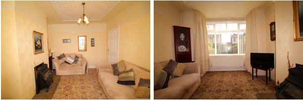
3.01m x 4.30m (9' 11" x 14' 1") Double glazed bay window, radiator, electric fire and picture rail.