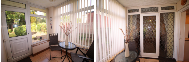
1.99m x 2.89m (6' 6" x 9' 6") Tiled floor and double glazed windows, door into rear garden.

Important Information: These particulars, whilst believed to be accurate are set out as a general outline only for guidance and statements of representation of fact, but must satisfy themselves by inspection or otherwise as to their accuracy. No person in the property.