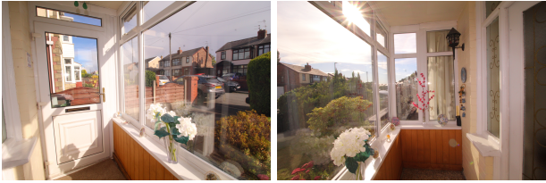
0.85m x 2.35m (2' 9" x 7' 9") PVC double glazed windows, tiled flooring.