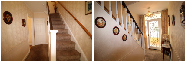
1.75m x 3.51m (5' 9" x 11' 6") Under stairs storage cupboard.