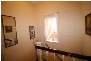
1.88m x 2.10m (6' 2" x 6' 11") Double glazed window.