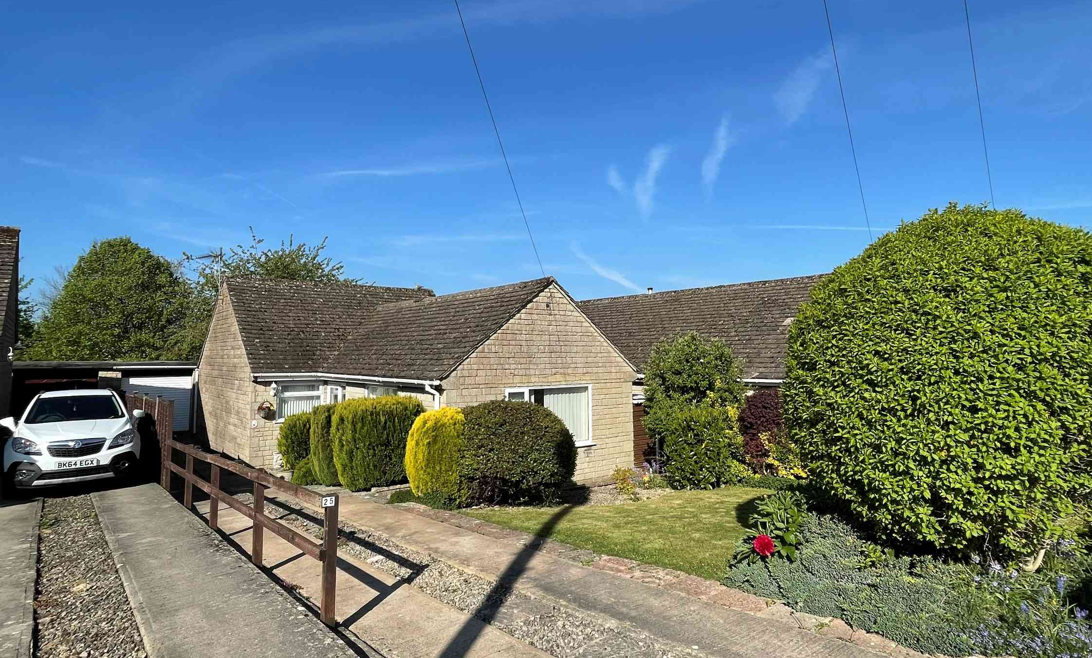
25 Lypiatt View, Bussage, Stroud, Gloucestershire, GL6 8DA Guide Price £367,000