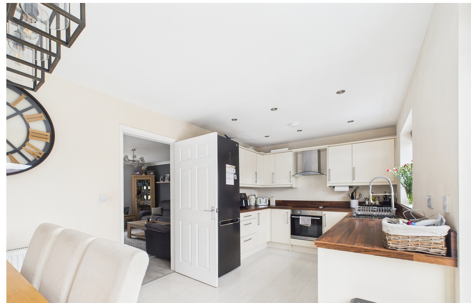
Whitemoor Lane, Belper, Derbyshire DE56 0HB £299,950 - Freehold