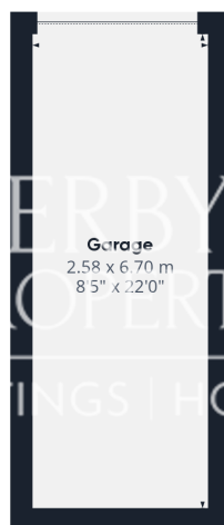
Ground Floor Building 2