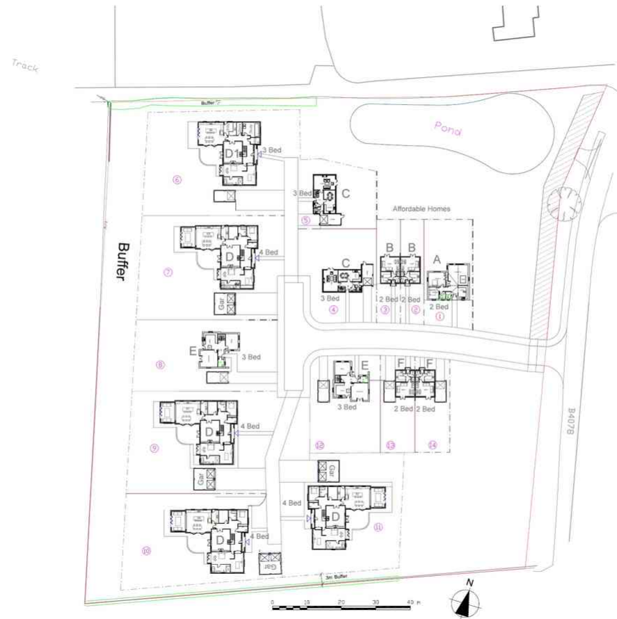
Site Plan 1:500 Scale