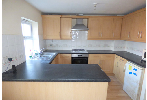
1 Parsons Road, Langley, Berkshire. SL3 7GU. £475,000