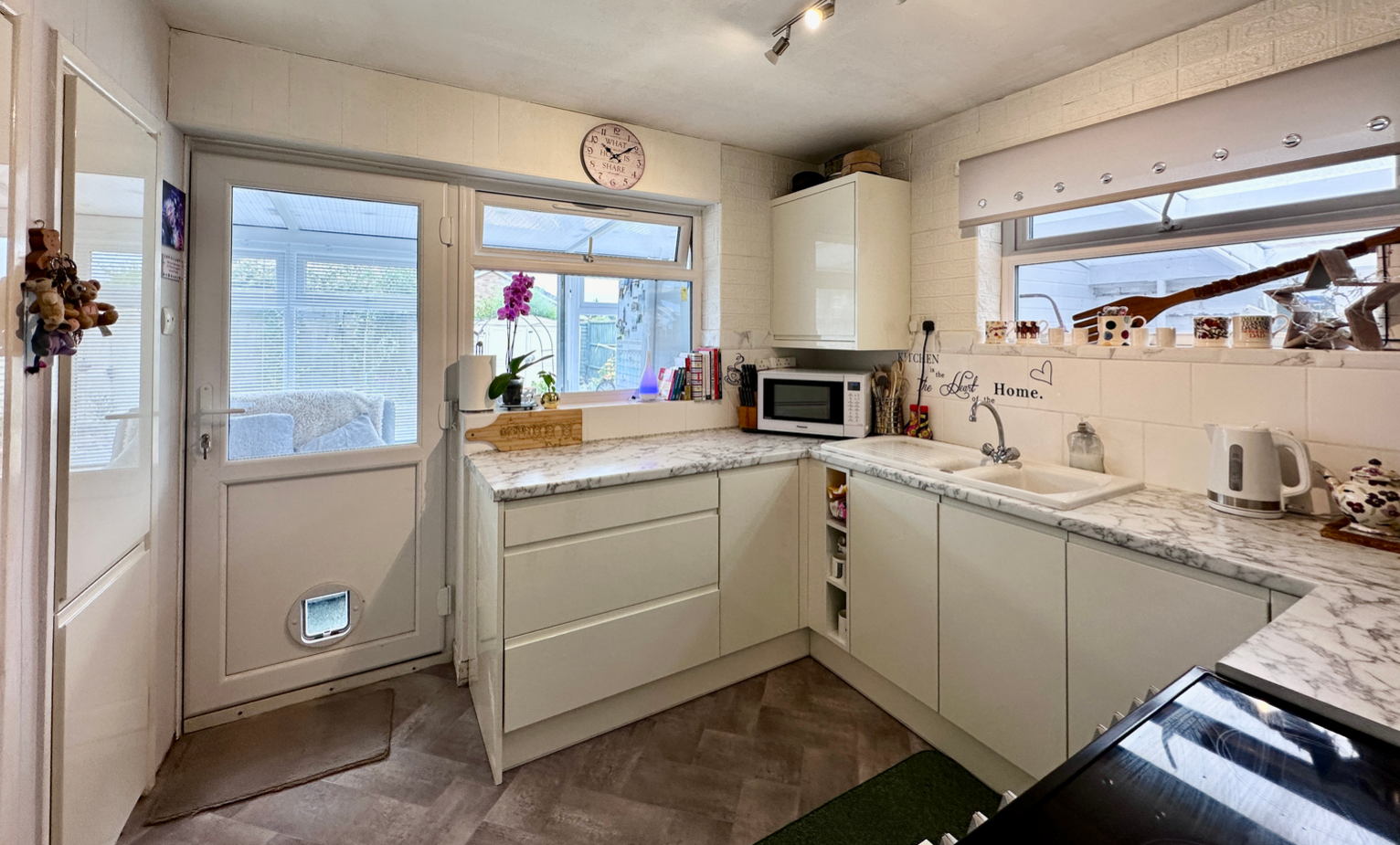
GROUND FLOOR 725 sq.ft. (67.4 sq.m.) approx.