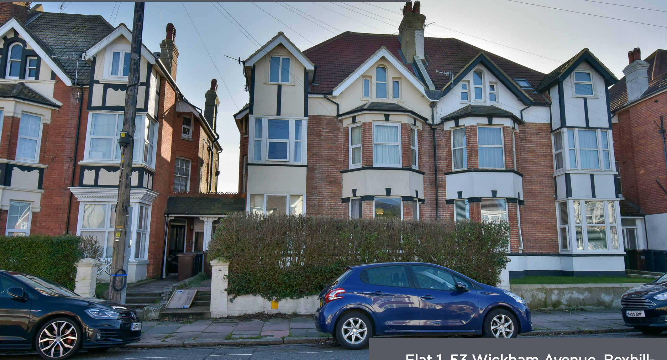
Flat 1, 53 Wickham Avenue, Bexhill-on-Sea, East Sussex TN39 3ES