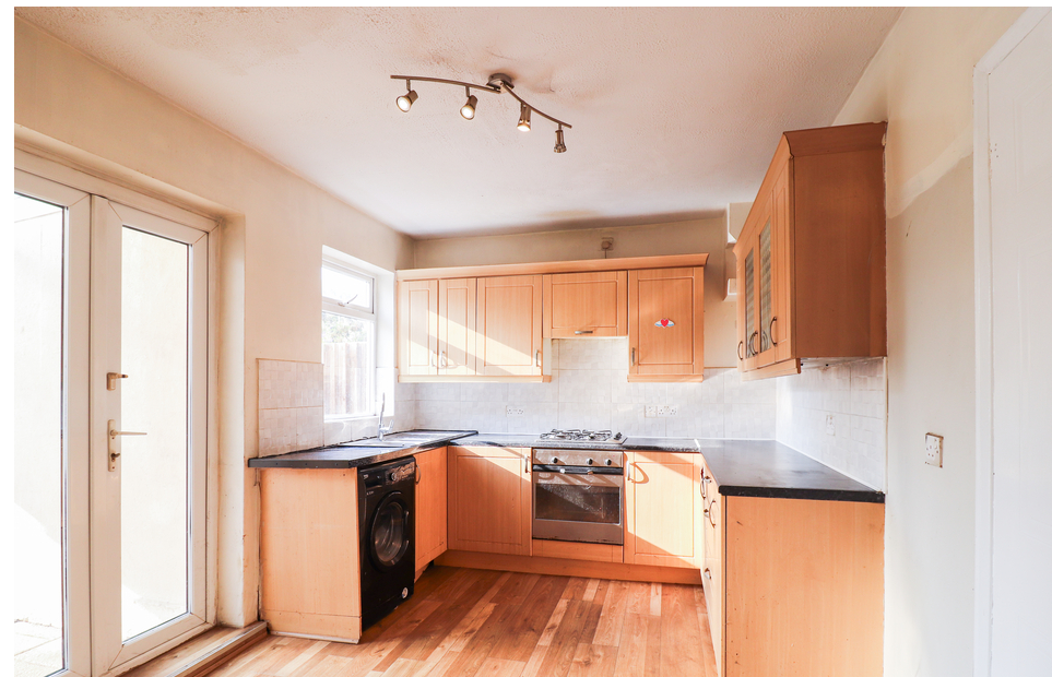
Wheatfield Road, Northampton NN3 2NE Offers Over £230,000 - Freehold