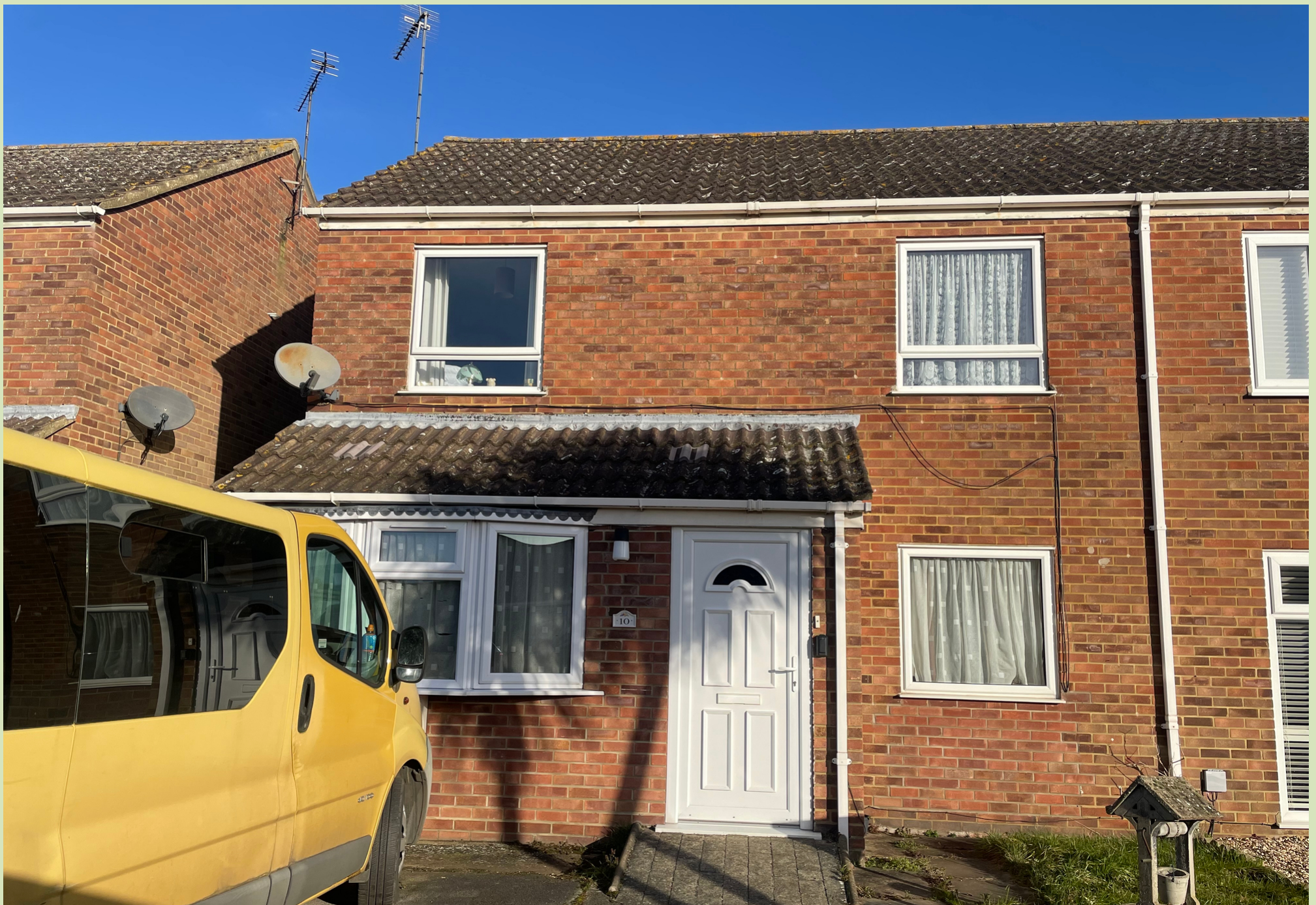
10 The Burnhams, Terrington St Clement Guide Price £239,950