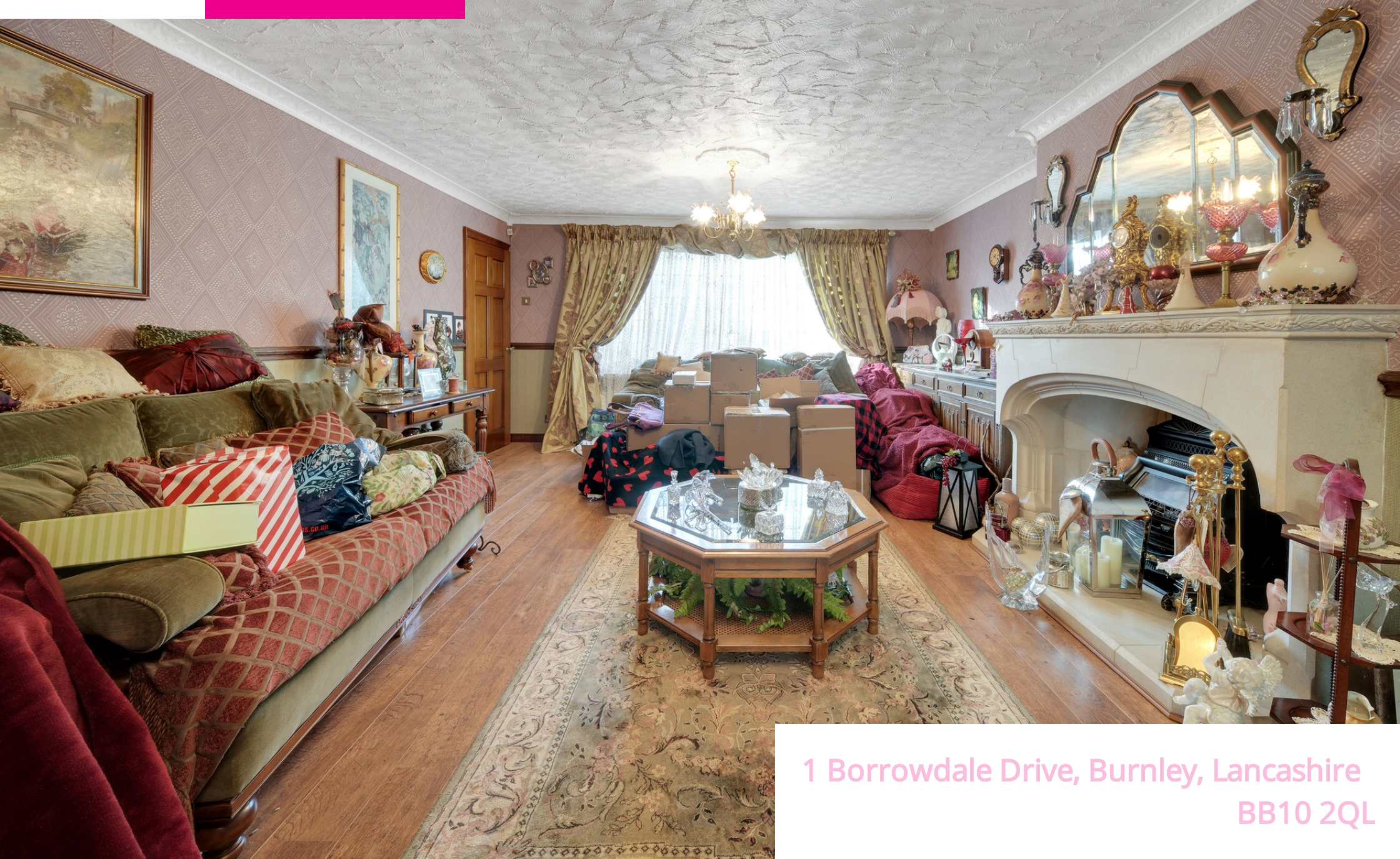
1 Borrowdale Drive, Burnley, Lancashire BB10 2QL