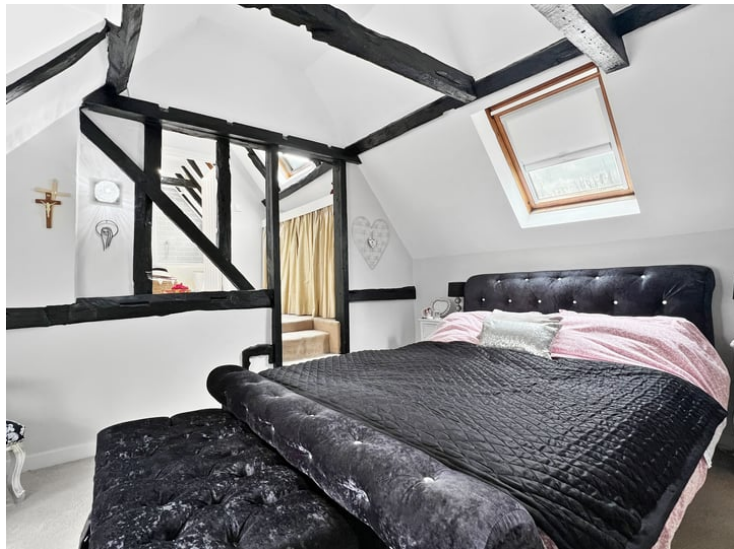
Master Bedroom & Dressing Area