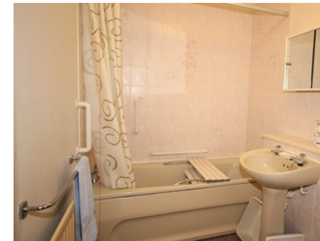
5 The Mews., Norton Hall Farm, Letchworth, Herts., SG6 1AL