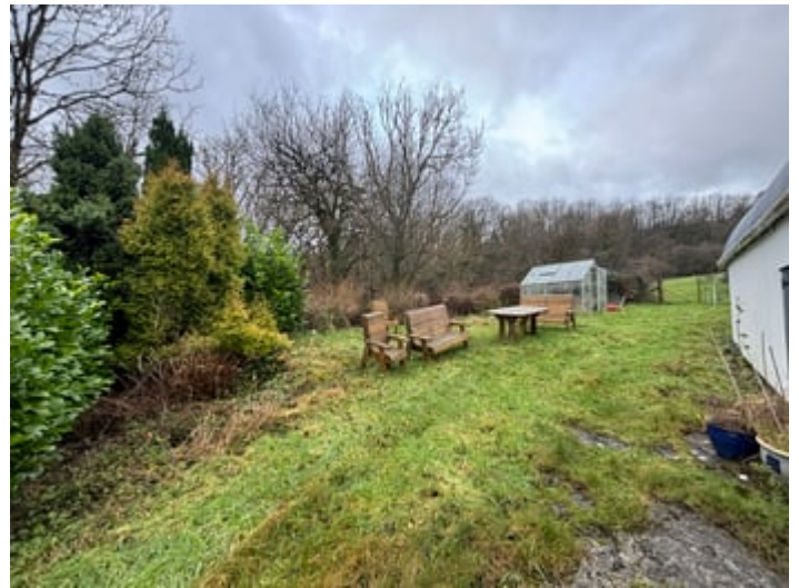
OFF LYING GARDEN (SECOND IMAGE)

With a small fruit tree orchard and bushes along with level lawned areas that runs down to a small stream. The property offers fantastic outside space.