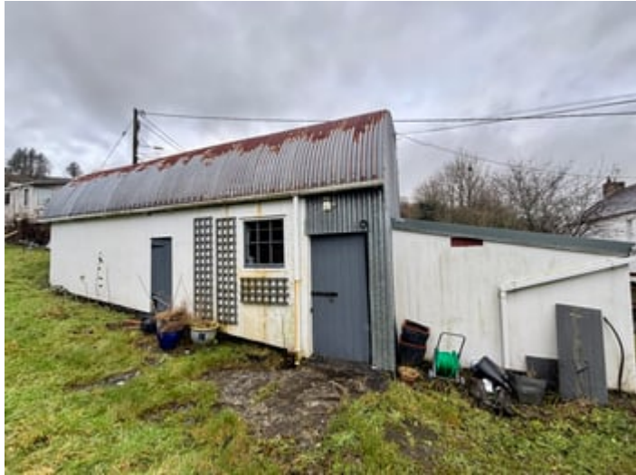
DUTCH/HAY BARN (SECOND IMAGE)

14' 6" x 13' 2" (4.42m x 4.01m). Built of block under a corrugated iron roof with electric supply and incorporating a Cow shed. Utilised as a workshop with work benches and original Cow stores.