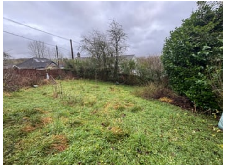
OFF LYING GARDEN (THIRD IMAGE)